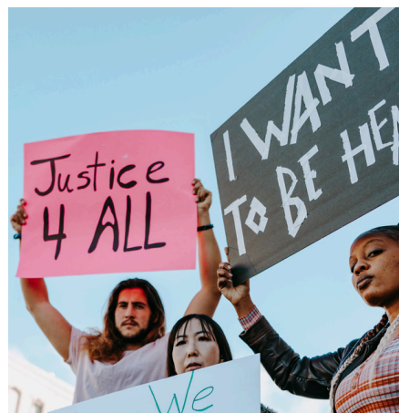
Humanities, Social Sciences & Law