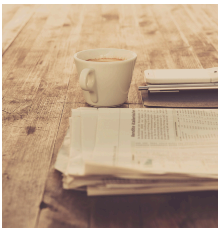
News & Views