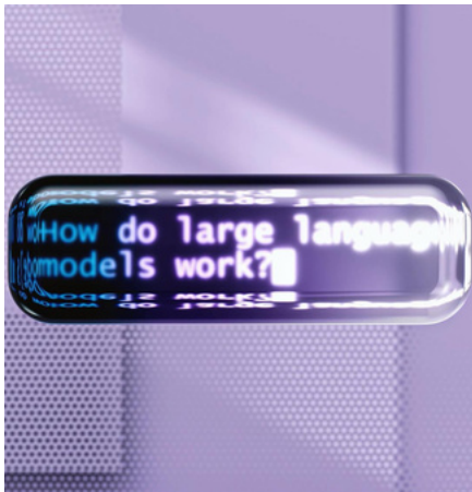
AI, Modeling & Simulation