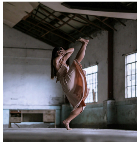
Performing Arts & Music