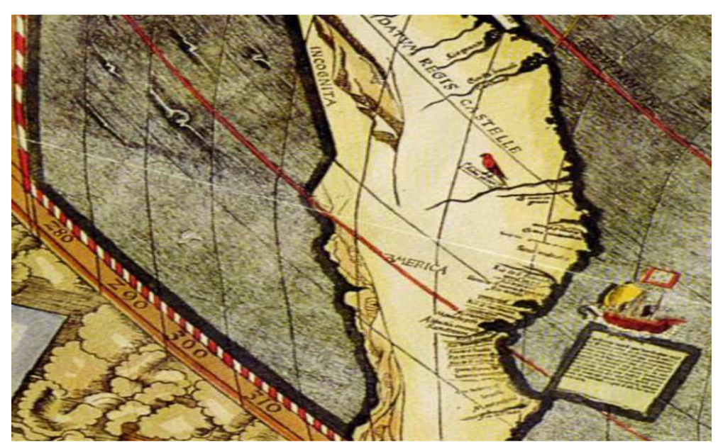
MARTIN WALDSEEMÜLLER'S WORLD MAP OF 1507, Detail showing the new continent named AMERICA

Between 1499 and 1502 Vespucci had undertaken four voyages to the coasts of Central and South America and had discovered the mouth of the Amazon. However, in 1507 Ringmann took him to be the discoverer of the New World. Accordingly he suggested calling the new continent 'America' for - so he argued -, "I see no reason why (this continent) should not be called 'Amerige', the land of Americus, after its discoverer Amerigo, a man of estimable wisdom, or 'America', for the names of 'Europa' and 'Asia' are also derived from the names of women". It would seem that Waldseemüller was at first hesitant and that it was only at the insistence of his friend that he agreed to adopt the new name on his maps. After this, the name "America" spread like wildfire.