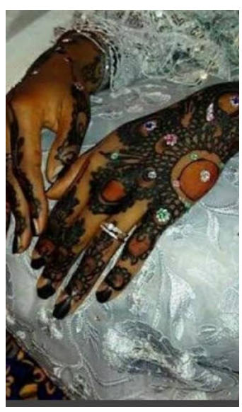
Background to the study